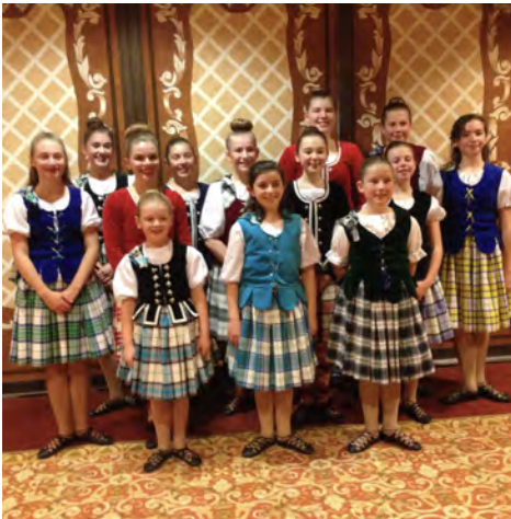
MHDA dancers pictured above at a dance out.