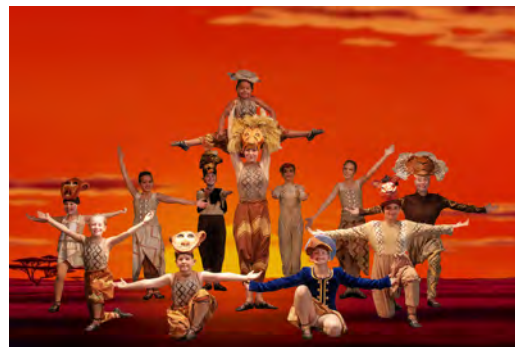
The KIK IGSHD team in their All-Age School Group choreography, The Lion King