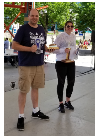
Our family fling winners