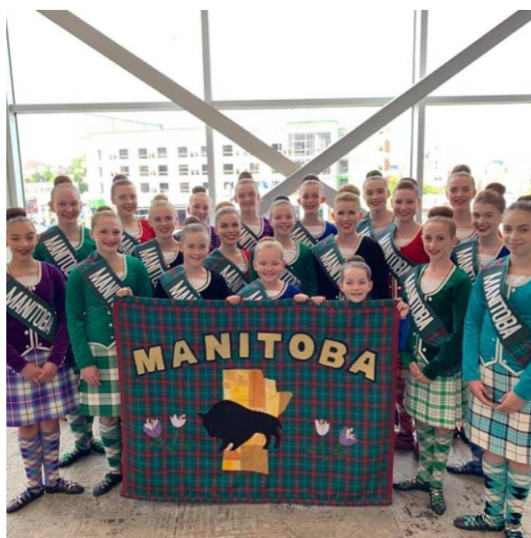
Manitoba representatives at Opening Ceremonies of the SDCCS 2019 series in Moncton, NB. Find more photos from the event on page 4.