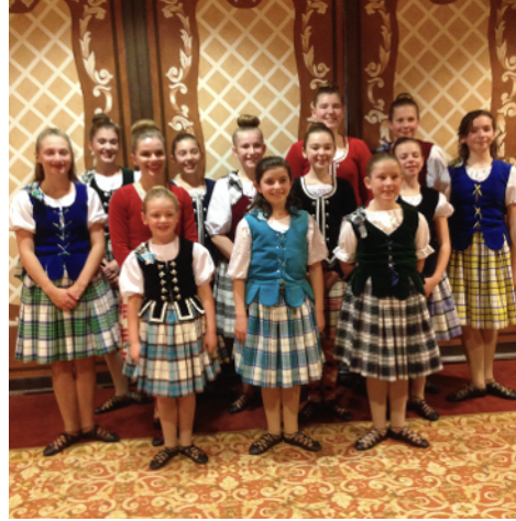
MHDA dancers pictured above at a dance out.

Do you know of or are you involved with a daycare, preschool, or kids program that would like to have MHDA perform traditional highland dancing?