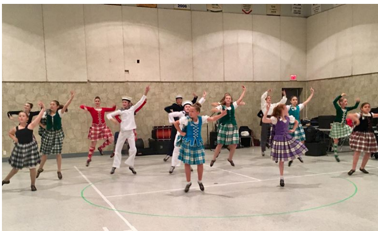
MHDA dancers pictured above performing at the Transcona Highland Gathering on September 22, 2018.

Do you know of or are you involved with a daycare, preschool, or kids program that would like to have MHDA perform traditional highland dancing?