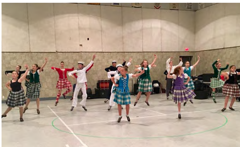
MHDA dancers pictured above performing at the Transcona Highland Gathering on September 22, 2018.

Do you know of or are you involved with a daycare, preschool, or kids program that would like to have MHDA perform traditional highland dancing?