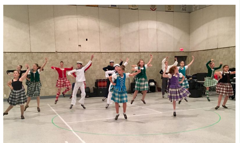
MHDA dancers pictured above performing at the Transcona Highland Gathering on Septebmer 22, 2018.

Do you know of or are you involved with a daycare, preschool, or kids program that would like to have MHDA perform traditional highland dancing?