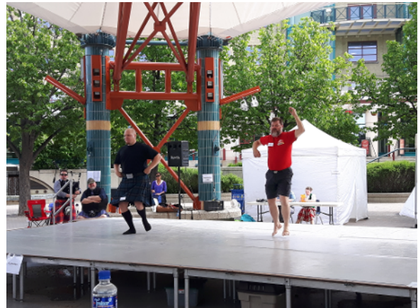
Some of the parents/family fling competitors!