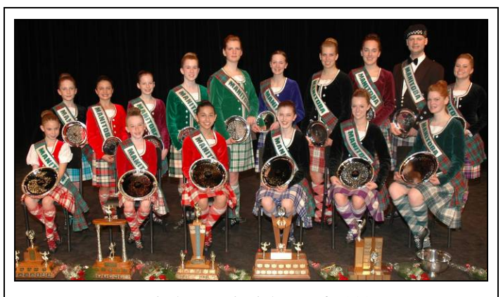
Manitoba Provincial Reps for 2007